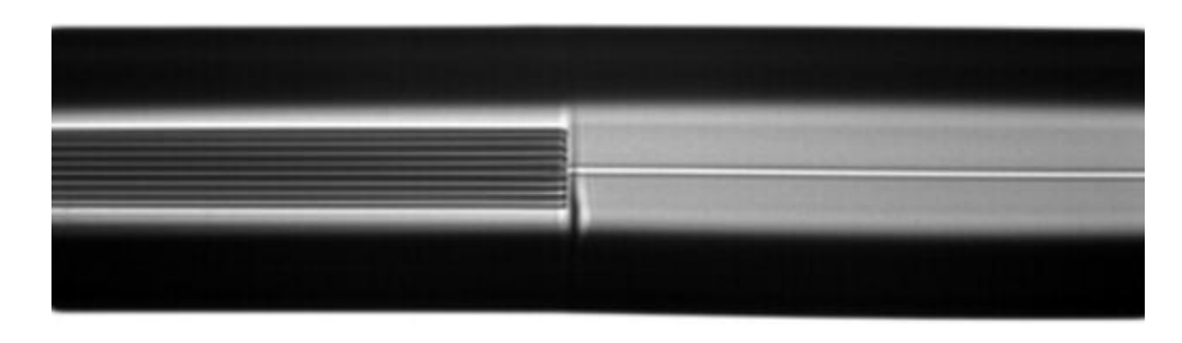
Figure3: Microscope imagine of a fusion splice between a photonic crystal fiber (PCF, left side) and a conventional fiber (right side). The hole pattern of the PCF can be seen.

Fiber connectors can also be used for temporary connections, as can be seen in the image below).